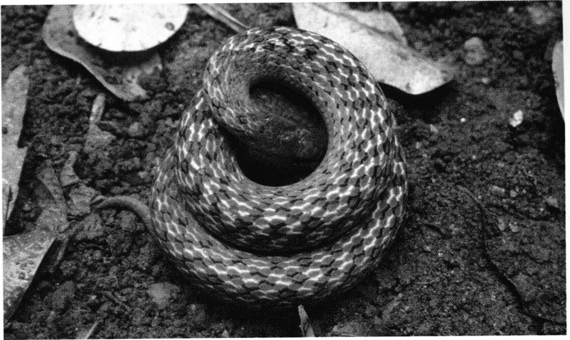
Figure 2. Defensive display by MCP 5737, showing the coiled body.