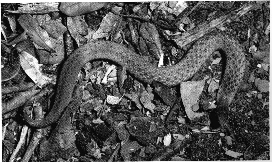
Figure 3. Defensive display by MCP 7590, showing the trunk dorsoventrally compressed.