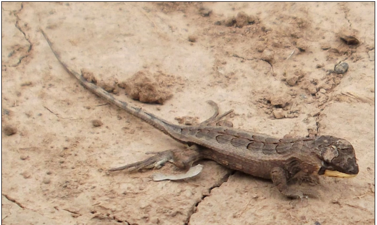
Figure 1. Individual of Stenocercus doellojuradoi (Freiberg, 1944). Locality of Pirizal, Mariscal Estigarribia District, Department of Boquerón, Paraguay. July 2014.

Comments — Active diurnal and nocturnal searches were performed on July 2014, to detect amphibians and reptiles on the ground at the edge of an unused road. Two individuals of Stenocercus doellojuradoi were found, both in the forest edge near the road. The ecosystem corresponds to xerophytic open forest with an understory of bromeliads near the Pilcomayo basin, in the Dry Chaco ecoregion