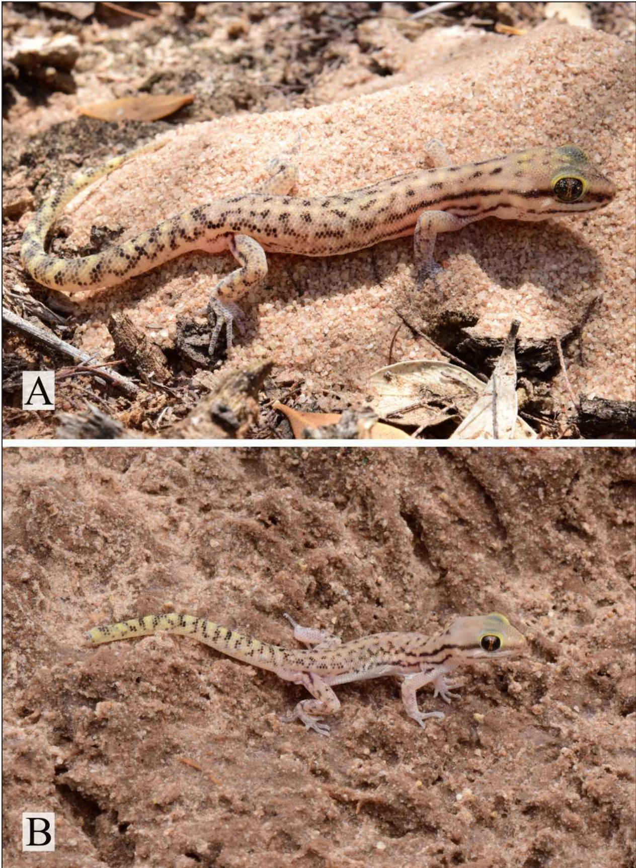
Figure 2. Homonota underwoodi from Salinas Grandes, Córdoba (Argentina), showing individuals on sandy (A) and calcrete substrate (B). Note the yellow coloration in head and tail.