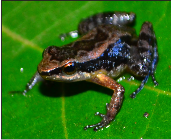
Figure 2. Adult male of Allobates goianus (SVL 17.80 mm; ZUFG15052) from the new locality of occurrence in municipality of Goiânia, state of Goiás, Central Brazil.

10% and housed in the Zoological Collection of the Universidade Federal de Goiás (ZUFG 15052 and ZUFG 15053).