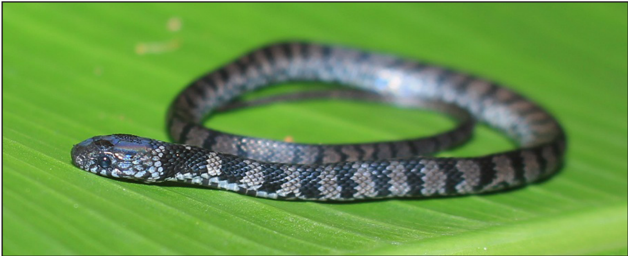
Figure 2. Subadult female Ninia pavimentata (UVS-V 01181), from the Baracoa, Sierra de Omoa, department's Cortés, Honduras.

collection of the Museo de Historia Natural of the Universidad Nacional Autónoma de Honduras in the Valle de Sula (UVS-V).