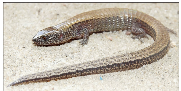
Figure 1. Live adult, male specimen of Colobosauroides cearensis (URCA 11.464) from Mauriti, Ceará.

The current work spreads the distribution of Colobosauroides cearensis in the state of Ceará toward to the municipality of Mauriti (7°22'46.08"S; 38°38'47.87"O) around 356 km to the north in relation to the location of type-species in the Sítio