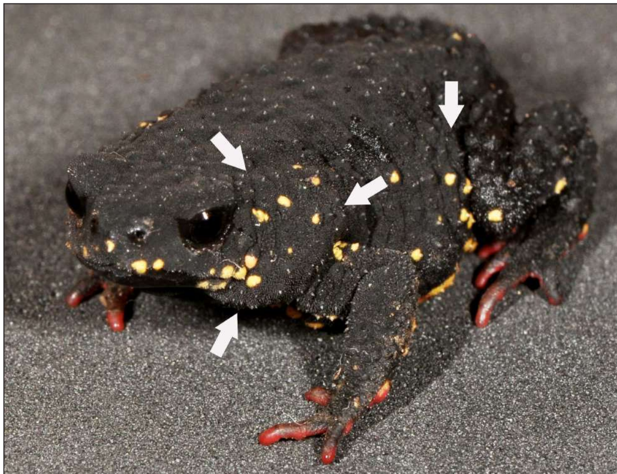
Figure 1. Lipoma in Melanophryniscus montevidensis . Arrows on the left indicate approximate boundaries of the tumour in the subcutaneous tissue of the cephalic region, which are evident externally; vertical one corresponds to its posterior limits.

Lipomas are benign and slow growing tumours (Hendrick, 2017), and their presentation in wild vertebrates seems to be sporadic. Particularly in amphibians there are only three previously published case reports, the first one is that of Reichenbach-Klinke and Elkan (1965) who describe this neoplasia associated to the urinary bladder in a toad Bufo bufo (Bufonidae). The other two known cases, like in the present study, correspond to single and circumscribed subcutaneous lipomas in Xenopus laevis (Pipidae; Balls, 1962) and Melanophryniscus sanmartini (Borteiro et al. , 2017). In these two reports the lipomas were approximately ovoid and relatively small masses located in the dorsum. As a difference, the lipoma in the present case largely extended over the flank. Similarly to the case in M. sanmartini , chromatophore cells were present but scarce.