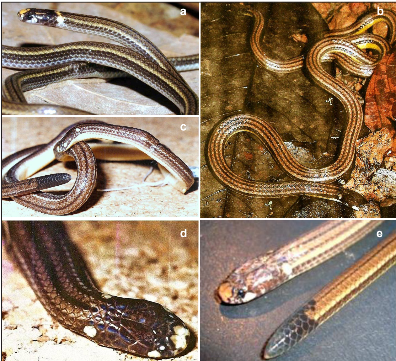
Figure 2: a. Live newborn of A. nigrolineata . To notice the presence of white nuchal collar almost complete (Anonymous). b. Juvenile specimen from Montagne de Kaw, in Roura, French Guiana. c. Fixed sub-adult (MCP.9193) from Madeira Riverbank, Rondônia. To notice the dominant brown coloration (M. Di Bernardo). d. Fixed sub-adult (MCP.9193) showing the characteristic white polygon on the snout, the total reduction of the supralabial blotch, and a pair of white blotches after the head, which are remnants of the white nuchal collar (Marcos Di Bernardo). e. Sub-adult from Parque Nacional do Trairão, Pará. To notice the snout becoming darker (Telêmaco Jason Mendes Pinto).

at the border with the state of Amazonas, Brazil, where the Amazon Forest biome also occurs. The specimen erroneously reported from Duke Reserve in Manaus (Amazonas) by Martins and Oliveira (1998) belongs to A. nigrolineata . Several references to Apostolepis pyimi , and most to A. quinquelineata (Fig. 5a), are references to A. nigrolineata , according to examination of figures and/or published data.