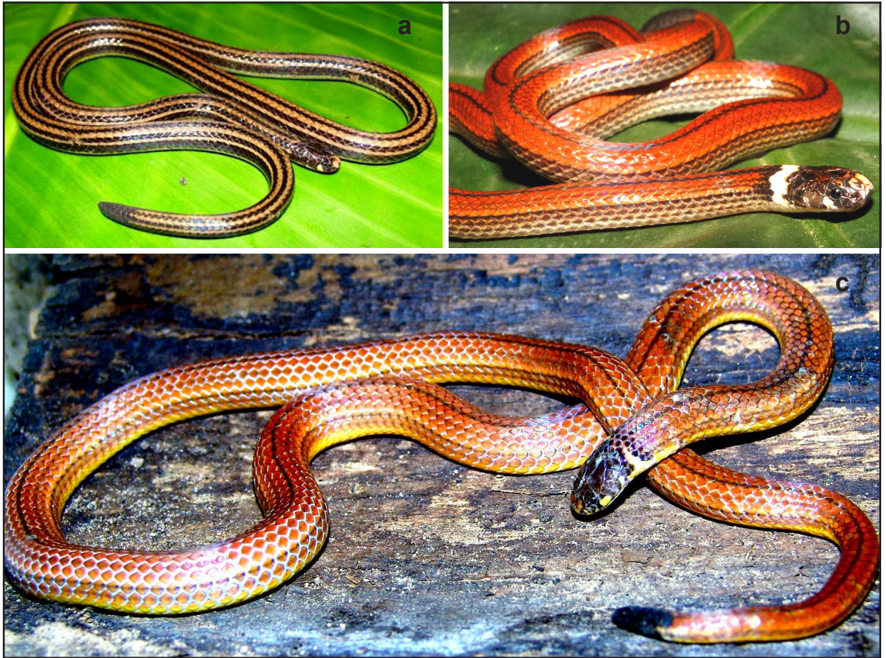
Figure 5: a. Apostolepis rondoni from Rondônia. To notice the presence of the tail blotch, which is different from that of A. quinque-lineata (Paulo Bernarde). b. Adult of Apostolepis nigroterminata Boulenger 1896, from Acre, Brazil (Danyella Paiva da Silva). c. Sub-adult of Apostolepis sp. endemic from Serra do Baturité, Ceará. To notice the vestige of the nucho-cervical collars (Daniel Loebmann).

2376, 2643, 3306, 3940, 4718, 4720, 4721, 4723, 4730, 6958, 7557). Santa Rosa: Vigia Road (MPEG.3941-3944, 4614, 4615, 4617, 4620, 4642, 5656, 5665, 5666, 5683, 5685, 5686, 5690, 6774, 6792, 6799, 6802, 6887, 6984, 6988, 7487, 7497, 7537, 7542, 8490, 8514, 8517, 8551-8553, 8583, 9255, 9256, 9349, 10593, 10597-10599, 11835, 11836, 12590). Serra dos Carajás (MZUFV.1071). Uruá: Parque Nacional da Amazônia (IBSP.7285), near Tapajós River (MZUSP.7287). Viséu: Bela Vista (MPEG.1735, 2292, 2293, 3714, 5239, 5249, 7291, 7325, 7338, 7701, 8959, 11267, 11268, 15126, 15127); Curupati (MPEG.10010, 10884, 10886, 10887, 13260). Fazenda Real (MPEG.1787, 2323, 2324, 2349,