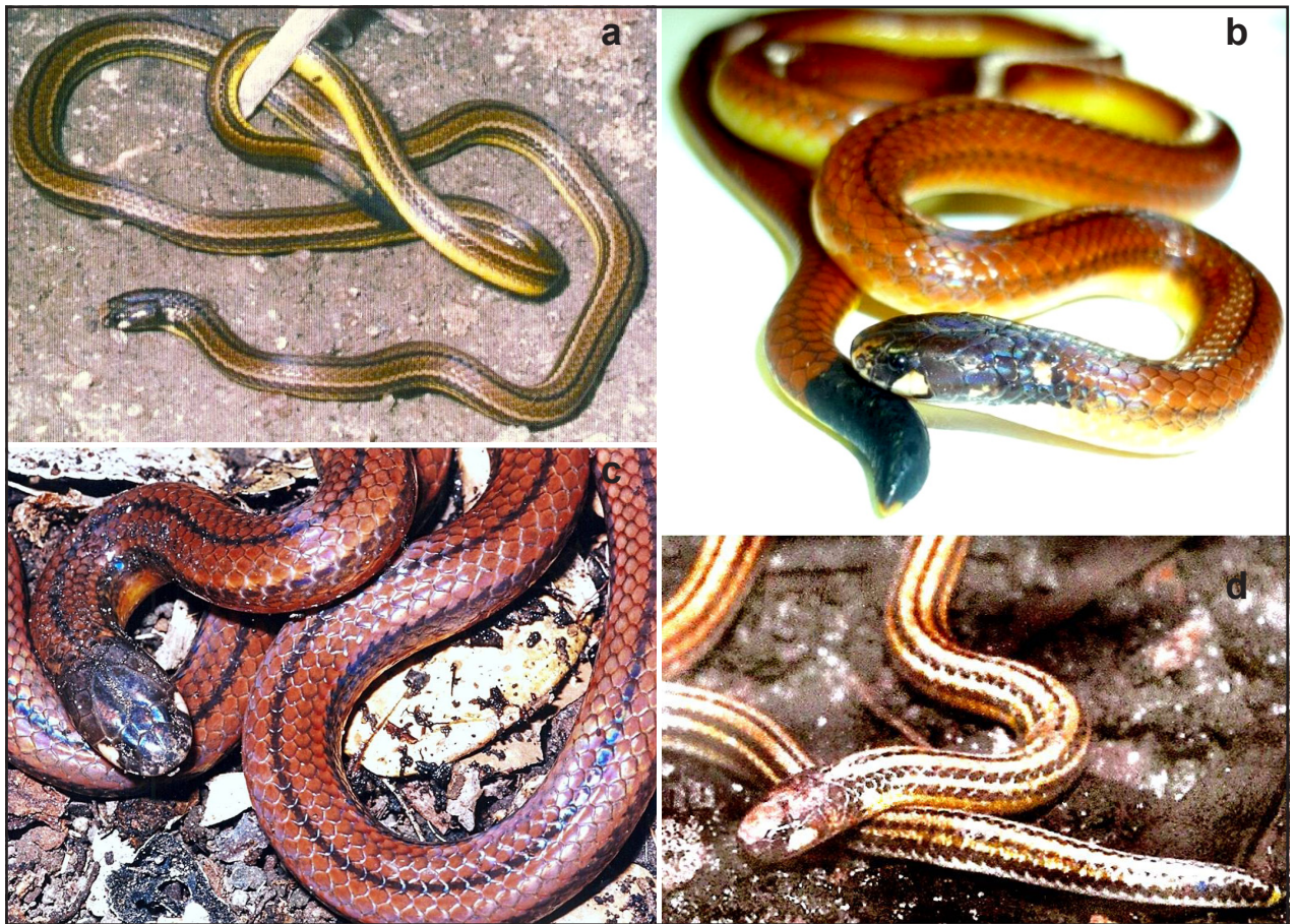
Figure 3: a. Live nascent adult from Guaporé Riverbank, Rondônia. b. Adult live specimen from, Belem, Pará. To noticed the dark snout (Breno Almeida). c. Adult specimen from Ilha do Outeiro, Pará. To notice the absence of paravertebral stripes (Marcos Di Bernardo). d. Live specimen of Apostolepis quinquelineata . To notice the absence of tail blotch (Omar Machado Entiauspe Neto).

The quinquelineata group is represented by A. quinquelineata (Fig. 5a) and A. rondoni (Fig. 5b) which are very small species, with five black permanent stripes and, light background color, sometimes yellowish or reddish orange. They are distributed in very distant populations, the former in northern Amazonia, and the latter in western Amazonia (Fig. 4).