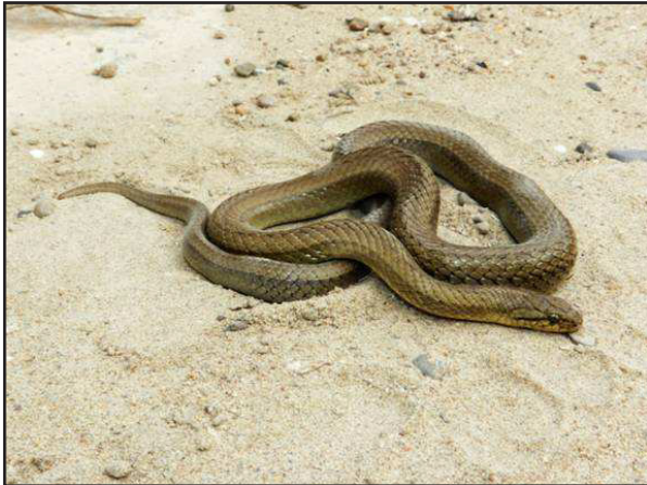
Figure 2. Adult Tachymenis chilensis from vicinity of Esquel city (LJAMM-CNP 14448).

specimen was based on collected specimens from Piltriquitrón Mountain in El Bolson, Los Lagos Department, Rio Negro Province (LJAMM-CNP 7511). On September, 20th 2011, we received a donation of an adult alive animal (SVL = 472 mm, TL = 557 mm) collected by a farmer, A. Cayul on his property, in the suburban area of Esquel city. Habitat of the collected site was an edge of an artificial plantation of Pinus spp., but close to it, still persist some patches of Nothofagus forest. This locality is situated 100 km (airline) south of our southernmost record for the species in Piltriquitrón Mountain, in Río Negro province and from the Chubut-Río Negro limits. Voucher specimen is deposited in the herpetological collection LJAMM-CNP of Centro Nacional Patagónico (CENPAT-CONICET) under number LJAMM-CNP 14448.