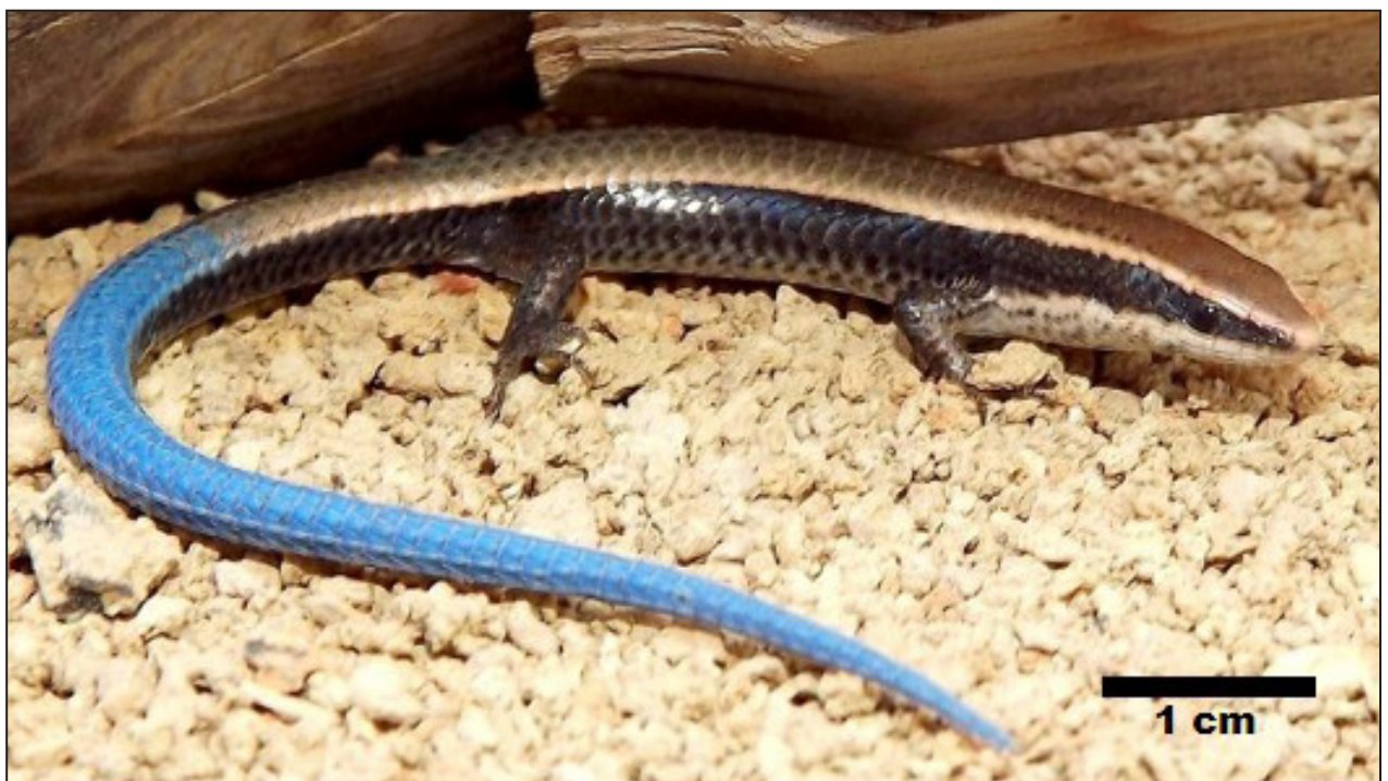
Figure 1. Individual of Micrablepharus maximiliani from Cuncas, Ceará.

Comments — Micrablepharus maximiliani (Fig 1) is a small gymnophthalmid lizard (CRL 38,2-45,7 mm) that is widespread distributed in South America, with records for Atlantic Forest, Caatinga, Cerrado, and Pantanal in Brazil, and Humid Chaco in Paraguay (Rodrigues, 1996a). According to Werneck et al. (2009), this species is widespread in Cerrado and enters neighboring biomes, as such as the Caatinga, where it occurs punctual form, in mesic habitats, generally associated with the most prominent relief region (Vanzolini et al. , 1980; Rodrigues, 2003). The population of this species also occurs in enclaves of Savannah in the Amazon region (Avila-Pires, 1995; Gainsbury and Colli, 2003). This species is diurnal