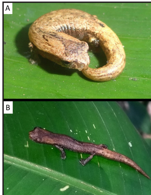
Figure 2. Adults of Bolitoglossa rufescens with typical color patterns of light brown (A) and dark brown tones (B), both observed in the “Altas Montañas” region from central-western Veracruz, Mexico.