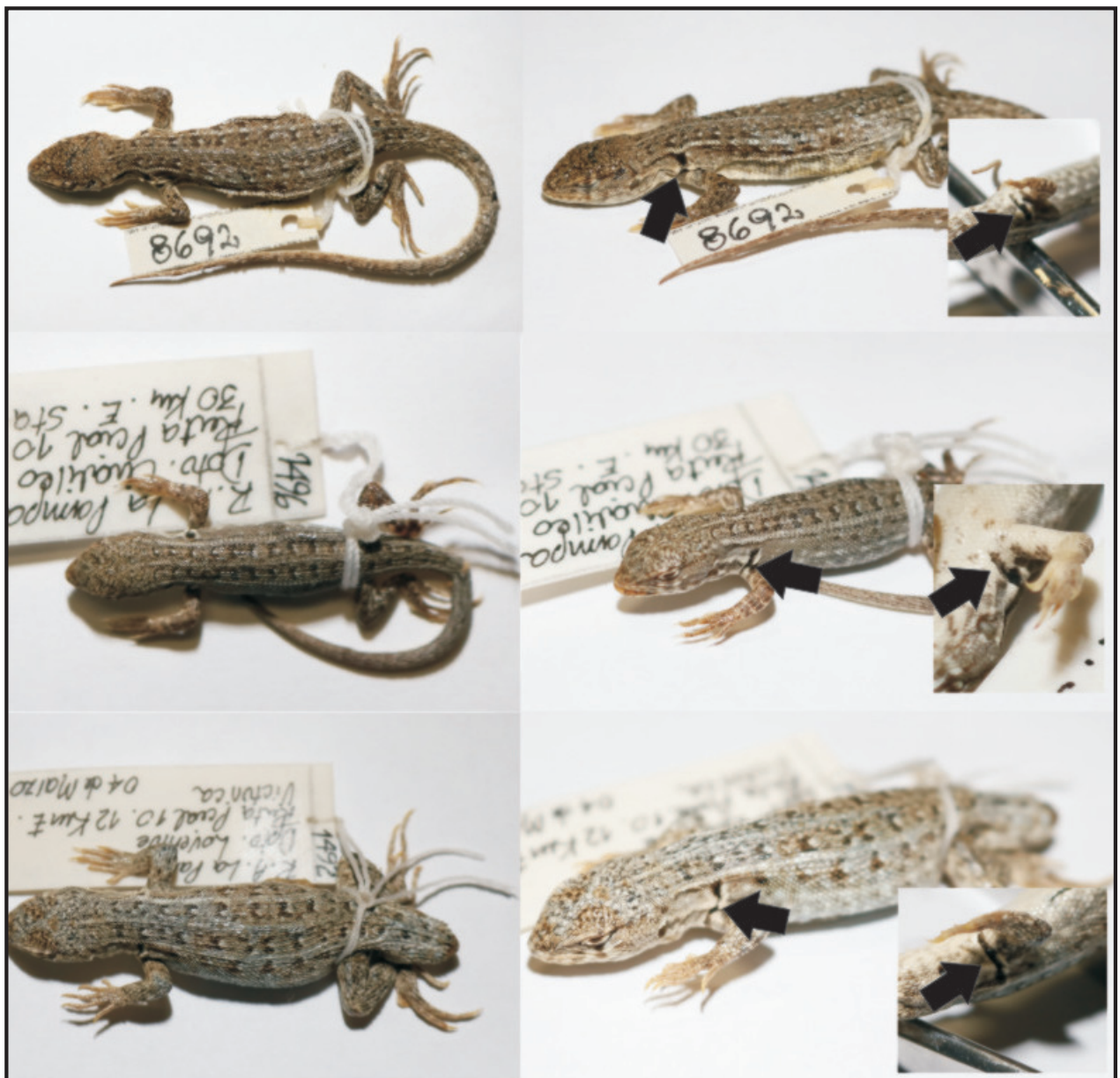
Figure 1. Dorsal and lateral view of the three specimens of Liolaemus grosseorum showing the characteristic diagnostic coloration patterns of the species. Black arrow marks antehumeral black spot.

S; 69° 41' 19.8" W, WGS84, 573 m elevation). 02 December 2007. Collected by L.J. Avila, M.F. Breitman & N. Feltrin. Adult female (SVL = 50.3 mm) under