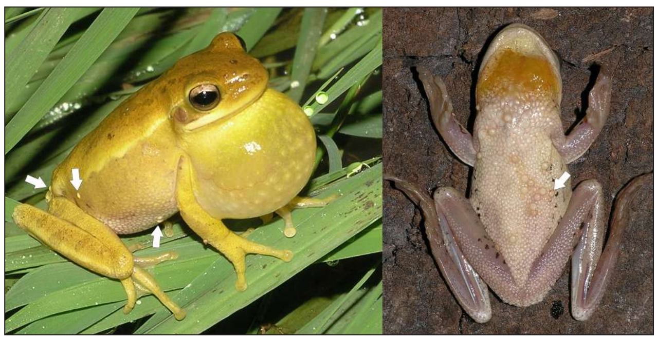
Figure 1. Frogs of the species Boana pulchella (Hylidae) at Laguna de Rocha, Uruguay, infected by Valentines rwandae (Dermocystida). Left: male calling at a breeding site. Right: ventral view of another male in life. Notice the skin nodules that bear dermocystid sporangia (arrows).

In addition, we explored the data with a generalized linear model of binomial distribution (infected/non-infected) in which the presence of each pathogen was considered as the dependent variable. Season and year of sampling were considered as independent variables, as also the presence of the other pathogen. Variable contributions to the models were compared by means of analysis of variance, ANOVA-LRT (Zuur, 2009), and removed when not statistically significant ( \alpha \ge 0.05 ). Summer