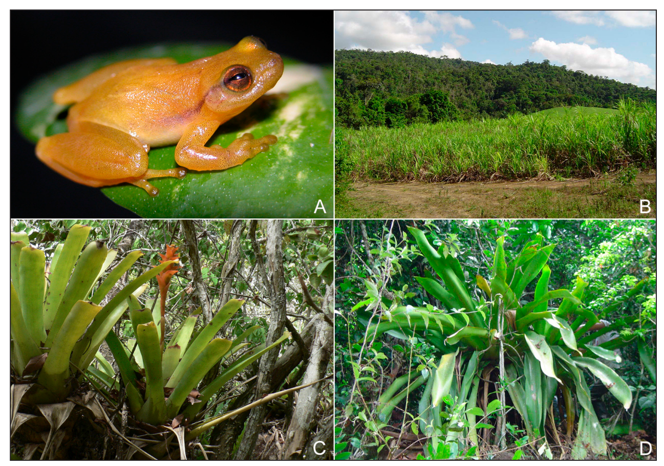
Figure 2. (A) Adult of Phyllodytes edelmoi in life (unvouchered specimen). (B) A remnant of the Atlantic Forest of Serra da Saudinha, surrounded by sugar cane crops. (C) and (D) Habitat of P. edelmoi .

the plants. Three genera of bromeliad plants were identified in the area studied: Aechmea, Canistrum (C. alagoanum and C. aurantiacum), and Hohenbergia (Fig. 2C, D). For each bromeliad, we calculated the volume (in cubic meters) using the formula: V = \pi radius<sup>2</sup> height/3, where radius was the distance between the central axis and the longest leaf, and height was the distance from the root base to the tip of the longest leaf. Ten aglomerates of bromeliads (41 bromeliad plants) were examined totalizing a volume of 33.95 m<sup>3</sup> in the rainy season (August and September, 2004 and April, 2005) and eight aglomerates (19 bromeliads plants) with a volume of 30.18 m<sup>3</sup> in the dry season (October and November, 2004 and January, 2005). Although the number of bromeliad was different among seasons, the total volume of bromeliads analyzed was similar standardizing the sampling effort.