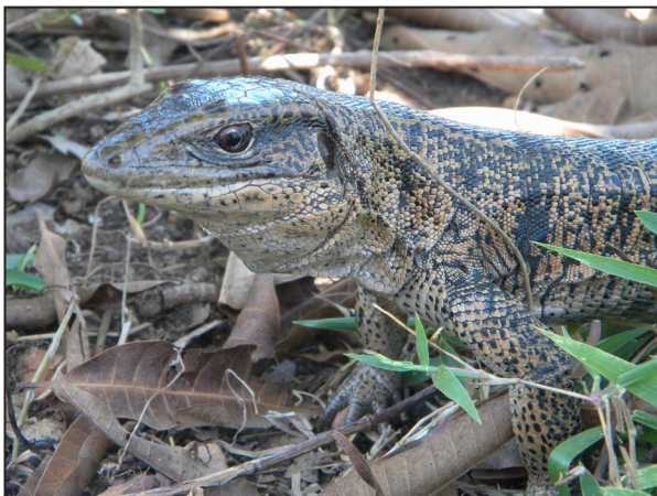
Figure 1. Adult specimen of Tupinambis teguixin (CHJJ 0666) from municipality of Barras, state of Piauí, Brazil.

Comments. — The genus Tupinambis Daudin, 1803 occurs in most part of South America east of the Andes, southward reaching northern Patagonian, in Argentina (Ávila-Pires 1995; Cei and Scolaro 1982). Contains four species: Tupinambis longilineus Ávila-Pires 1995, T. palustris Manzani and Abe 2002, T. quadrilineatus Manzani and Abe 1997, and T. teguixin (Linnaeus 1758) (Bérnils and Costa 2012). According to Ávila-Pires (1995), the species Tupinambis teguixin (Fig. 1) occurs in forests and open